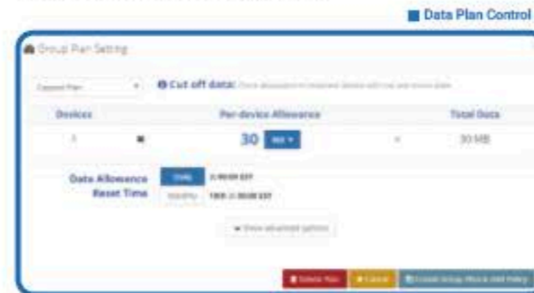
Data Plan Control

Understand and Manage cellular data usage, set allowances and control cost