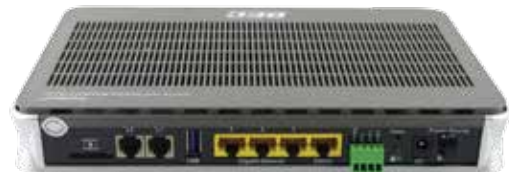
BEC 6300VNL Back