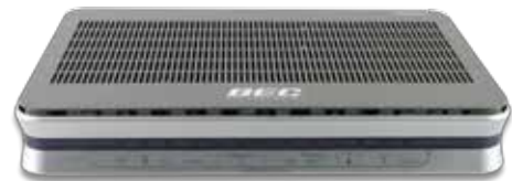
BEC 6300VNL Front

Integrated VoIP Technology provides advanced telephony features.