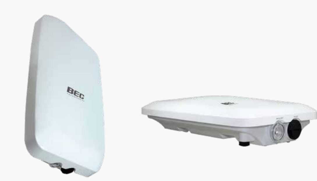
6900R21 LTE-Advanced Pro CBRS Outdoor Router CAT B CPE-CBSD

4900 R21 LTE-Advanced Pro CBRS Outdoor Router CBRS EUD